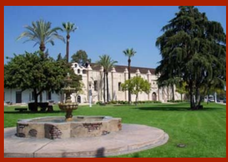
Plaza Park & Historic Mission